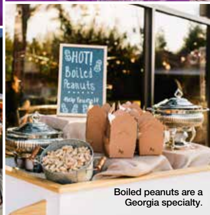
Boiled peanuts are a Georgia specialty.

enlarged and framed to greet guests at the reception, where dinner napkins were stamped "From Atlanta With Love."