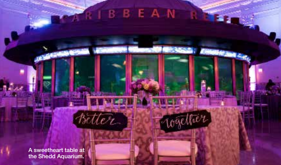
A sweetheart table at the Shedd Aquarium.