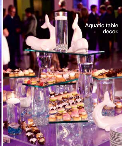
Aquatic table decor.