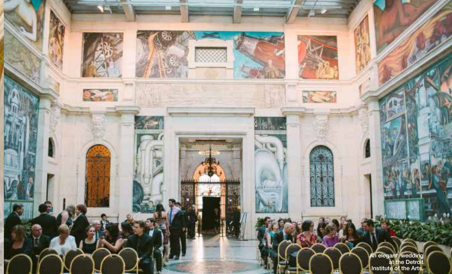
An elegant wedding at the Detroit Institute of the Arts.

E legant ballrooms, shabby-chic farms and picturesque country clubs will forever hold their place as prime spots for wedding receptions. (Tried-and-true traditions are always in style.) But increasingly, couples are choosing venues that aren't obvious first choices. Think art galleries, vintage movie theaters, rooftop hideaways, kids' campsites, breweries, even landmark business and government buildings that ooze character.