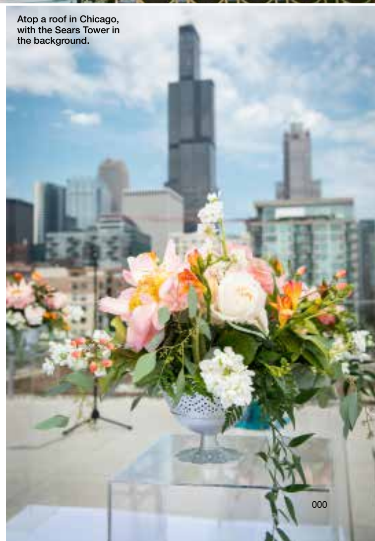
Atop a roof in Chicago, with the Sears Tower in the background.

With that in mind, we asked top wedding planners from across the country to share their best advice for couples who are inspired to stage their celebrations off the beaten path. ➔